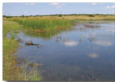
The Sterkloop Wetland after good rains

For those wishing to visit this area it is advised to do so in a group for safety reasons. The entrance gate (which is normally open) is situated on the Percy Fyfe road approximately 450m from the Matlala Road intersection (S23° 54' 15.82" E29° 24' 47.72").