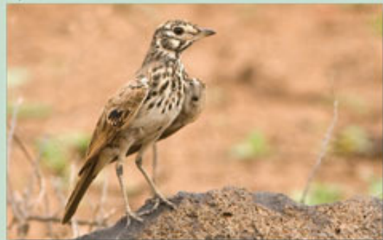
Dusky Larks were recorded in a number of pentads during the recent 'Giyani Atlas Bash'