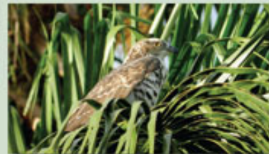
Wespedief - Richter van Tonder

Die tweede dag het goed begin met ons gereelde besoeker aan die gholfklub nl. die Wespedief